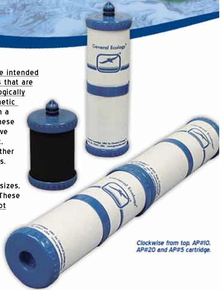
Clockwise from top, AP#10, AP#20 and AP#5 cartridge.

Aqua-Polish cartridges are available in three standard sizes, AP#5 , AP#10 and AP#20 . These products are intended to not remove minerals or salts.